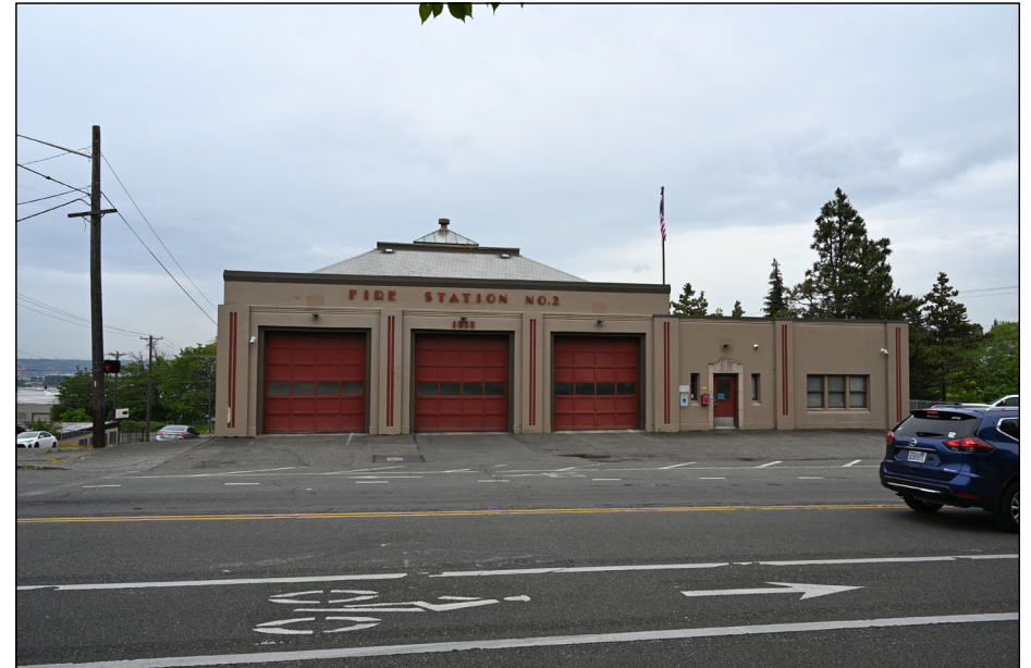
Image of old doors. Replace 3 old wood and single pane glass overhead garage doors with new insulated aluminum doors to match old doors as closely as possible

Drawing of new insulated aluminum overhead door to match old wood door as closely as possible. New Door will be painted the same red color as the old doors.