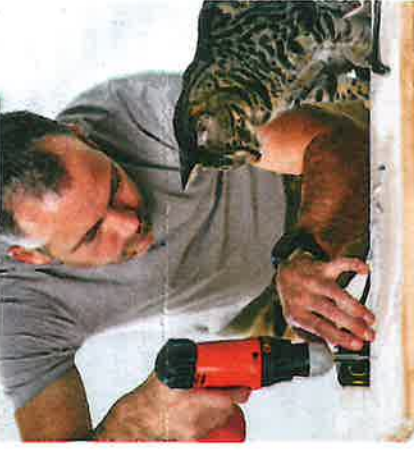
Most cats think a stranger working in "their" house is a reason to hide—but not all of them! A few figure the person needs close supervision.

People working on the house can stress your cat