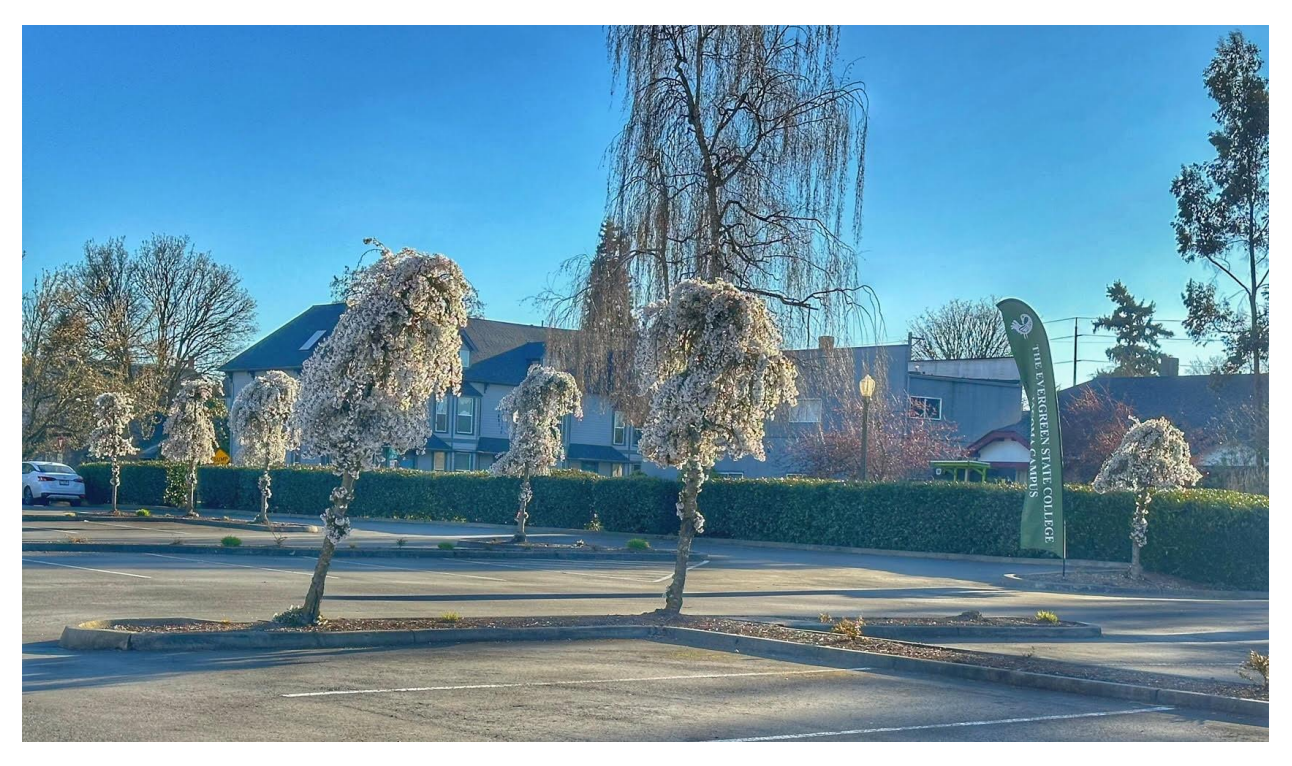
Park here at Evergreen and take a look. Surely this is unacceptable to all of us. My VW provides more shade. These should not be called trees.