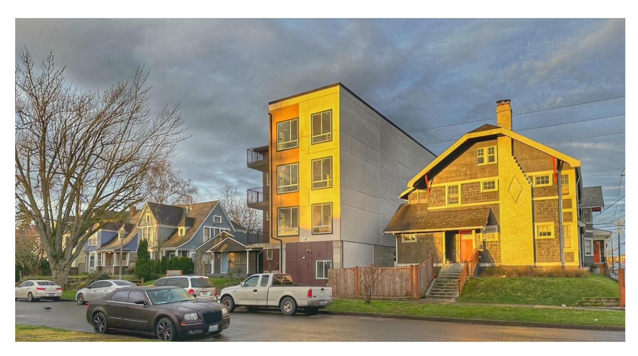
6TH AVENUE and SHERIDAN – SCALE? Just past SPEED WASH on Sheridan. Design? 4 stories. . .

It appears that Tacoma is eliminating the requirement to provide trees on a number of project types. Why?