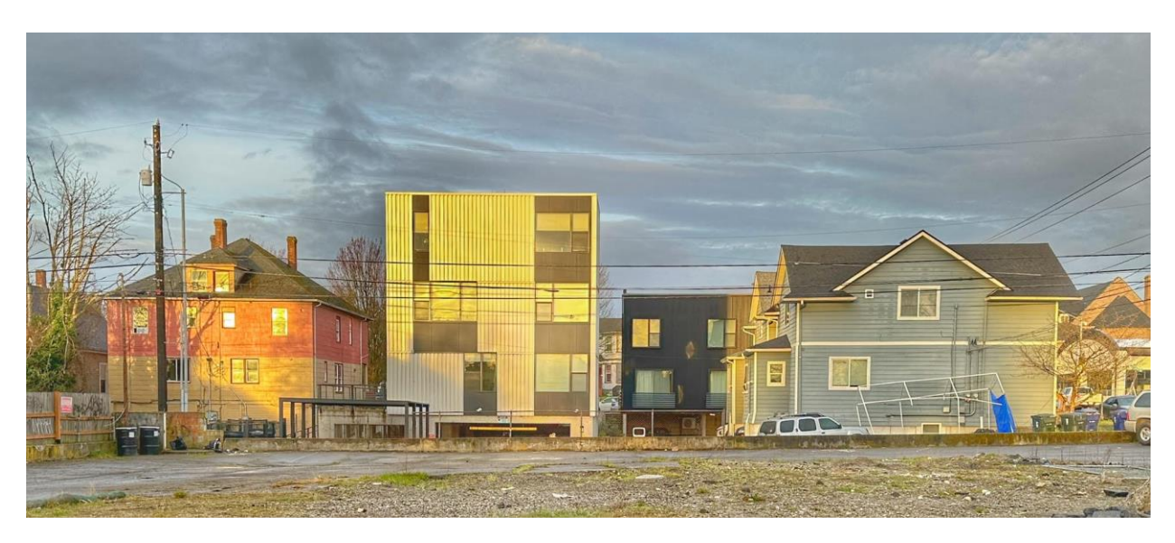
3 story infill. Very big on this block. Not to scale and not to any design. Design Review?