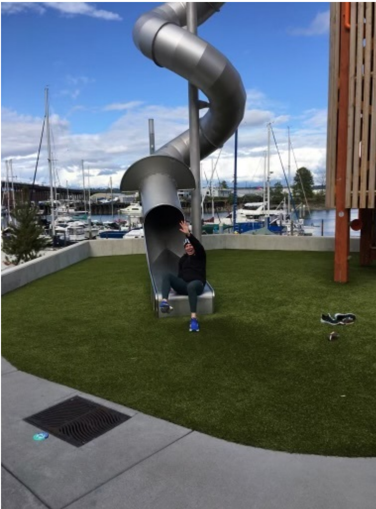
I went down the 3 story slide at the new Melanie Dressel park.