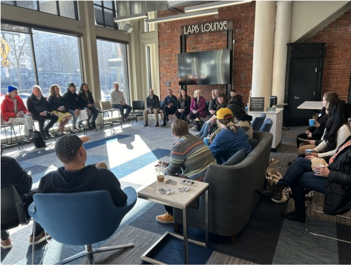
I attended a meeting of the Downtown Tacoma Partnership at KNKX.