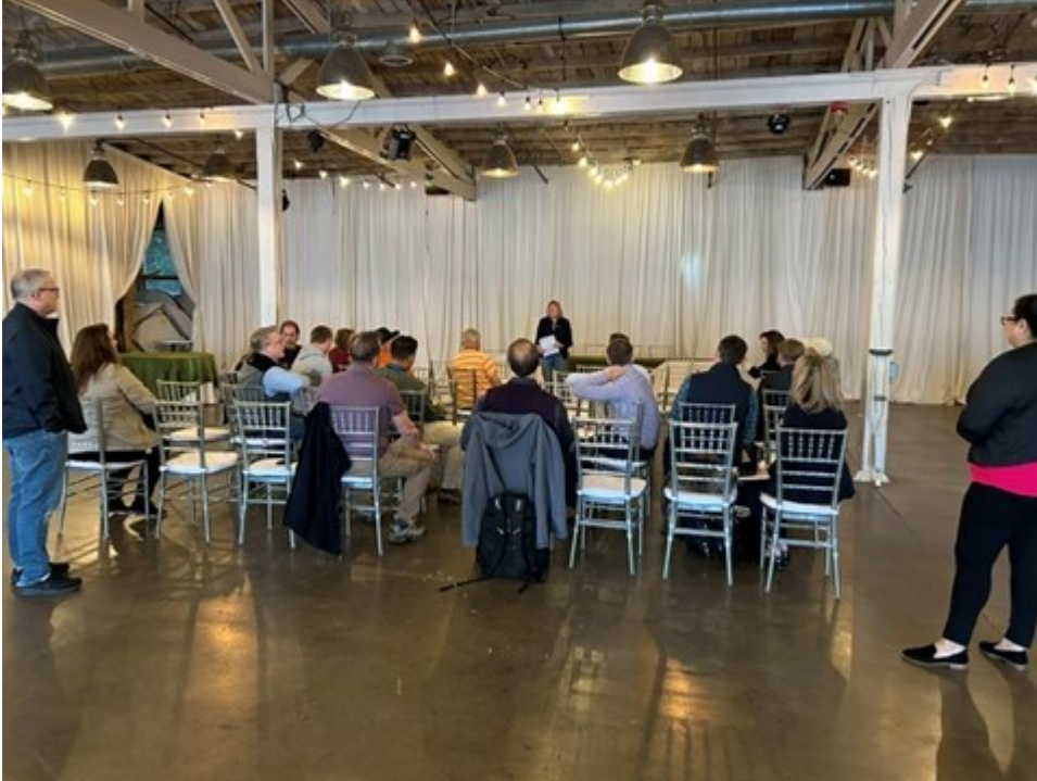
I hosted a meeting with Dome District businesses to discuss upcoming infrastructure projects.