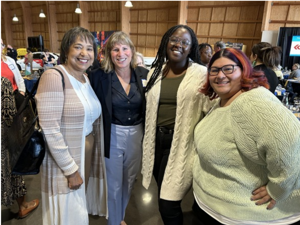
Attending the Associated Ministries Leading the Way Home Breakfast at The LeMay Car Museum.