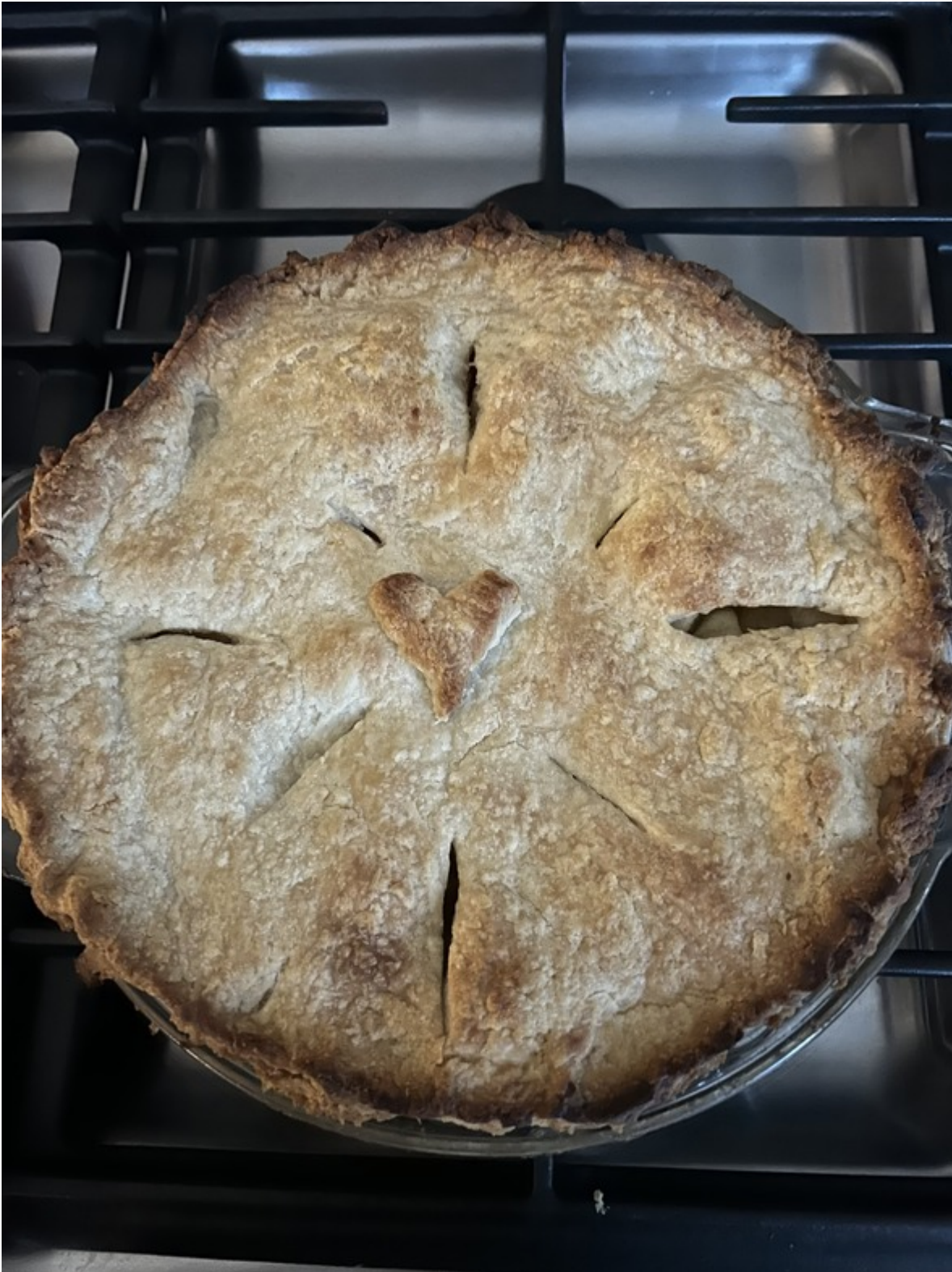
An apple pie on Mother's Day. My first apple pie I have made this year!