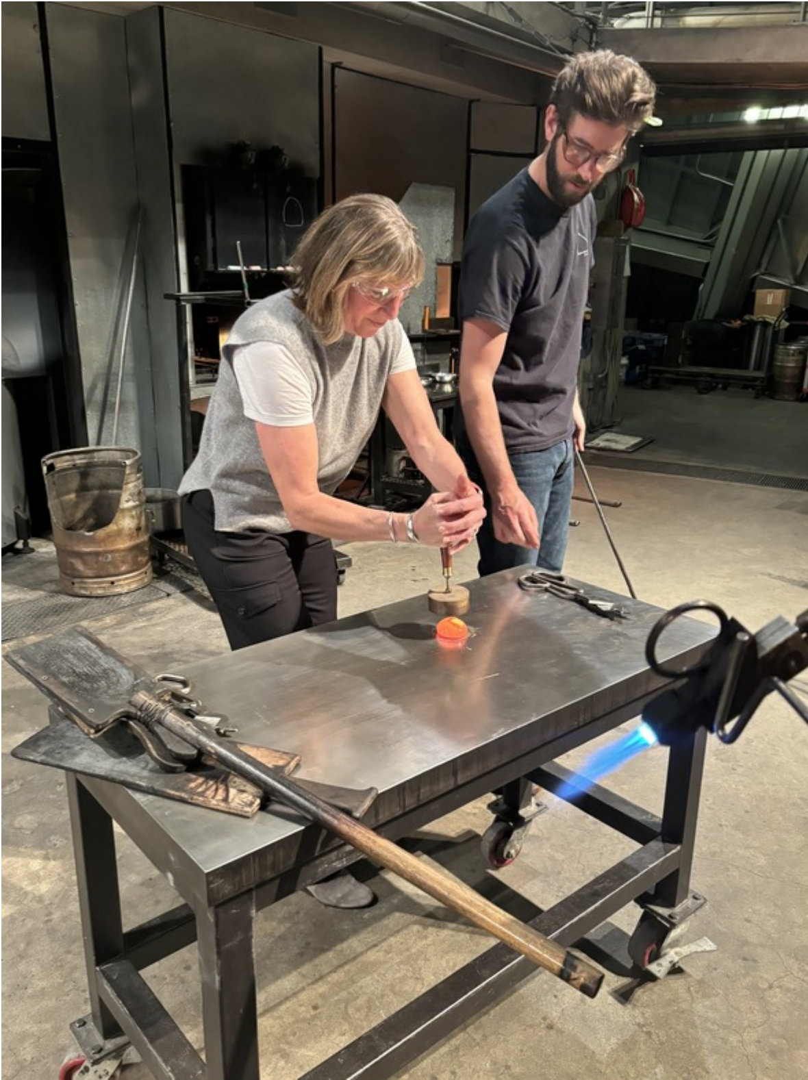
I had the opportunity to make glass medallions with City of Tacoma logo. Thank you to the Museum of Glass staff for all their assistance.