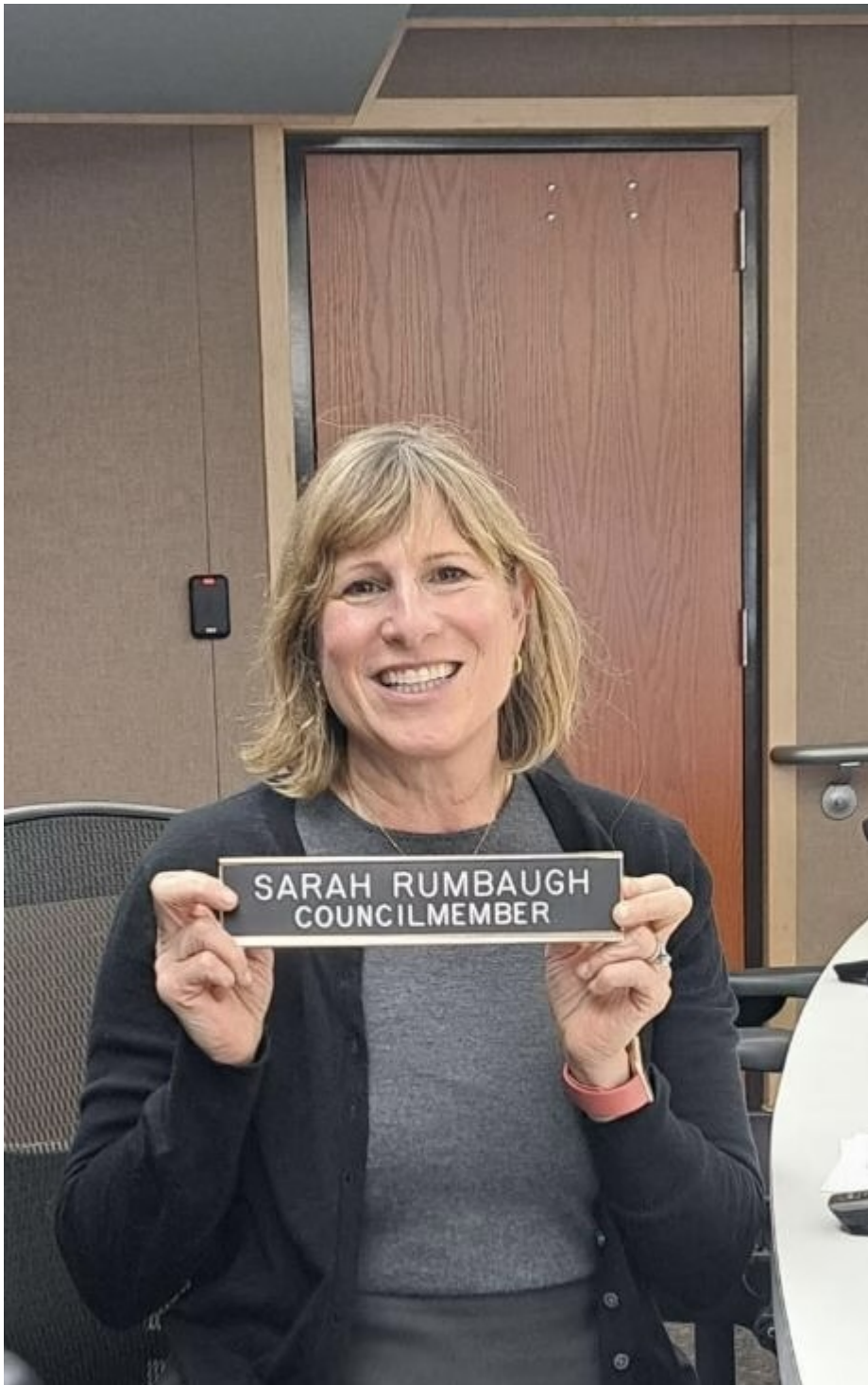
A photo of my nametag as a member of the Pierce County Committee on Homelessness.