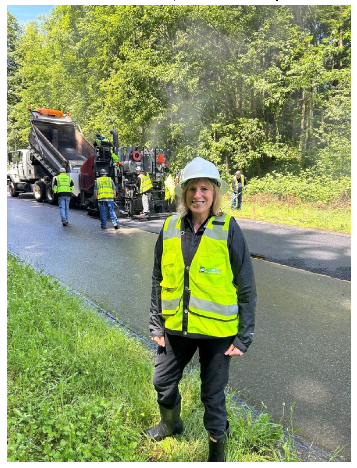
I joined our Tacoma Public Works Department as they worked to replace and fill parts of Northshore Parkway in NE Tacoma.