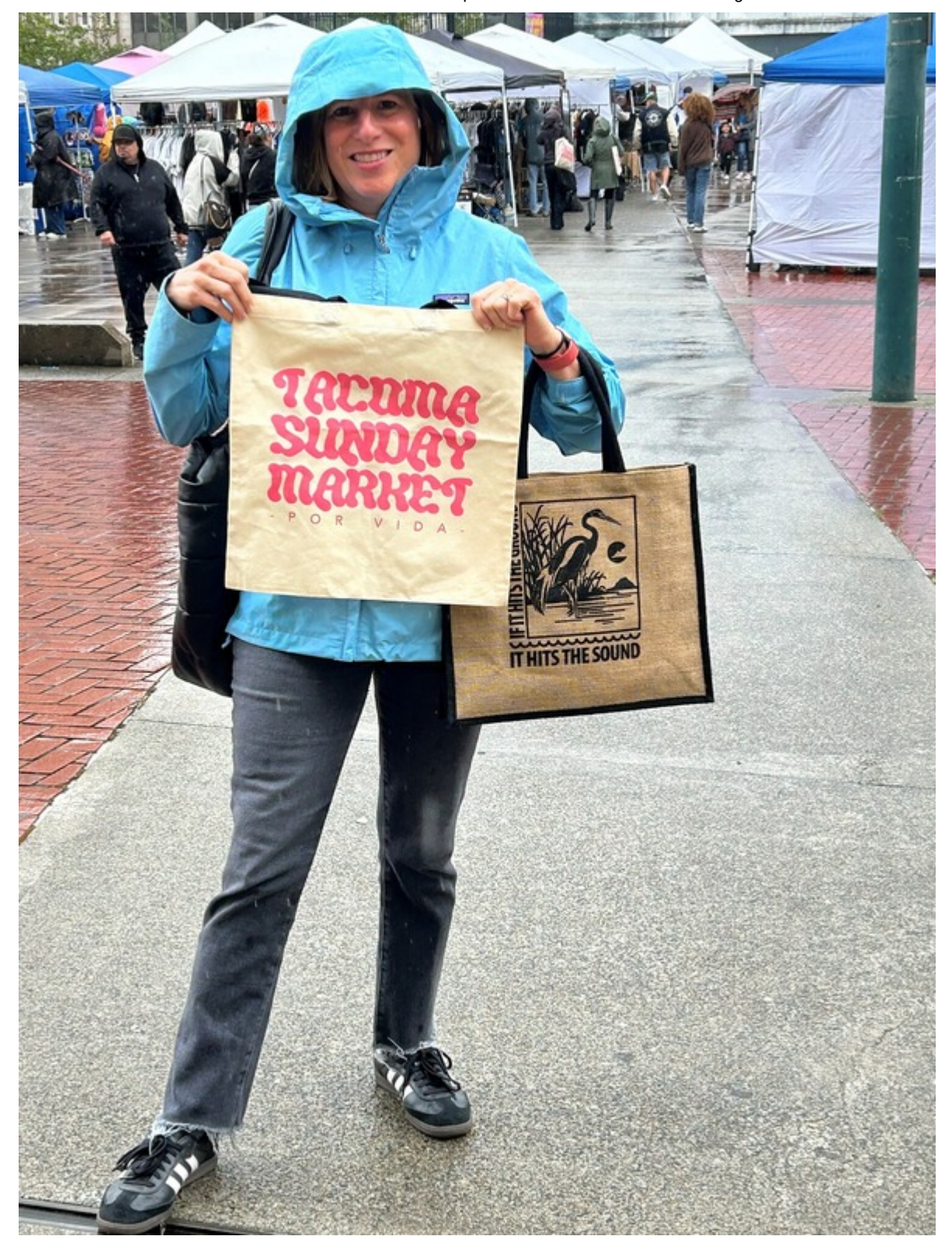
It was a wet one, but well worth it! I was happy to join the vendors who set up shop for the first outside Tacoma Sunday Market on Broadway Avenue.