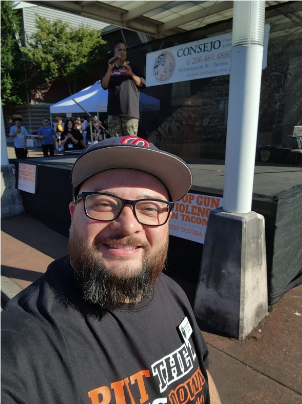
Visited the second 253 of Peace in the Tac – Wheels Up Guns Down event, at Mt Tahoma High School. This event provided community resources, back to school supplies and free food as community gathered to take a stance against violence.