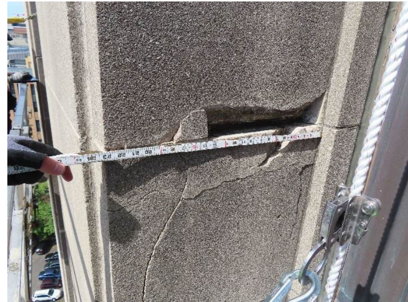
Cast Stone Condition