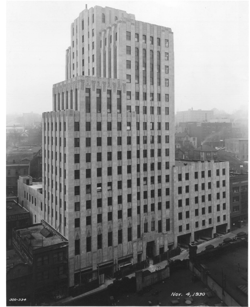
Credit: Northwest Room at The Tacoma Public Library, (BU-10657), 1930