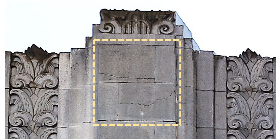
Example of Area Needing New Cast Stone Units (West Façade Garage)