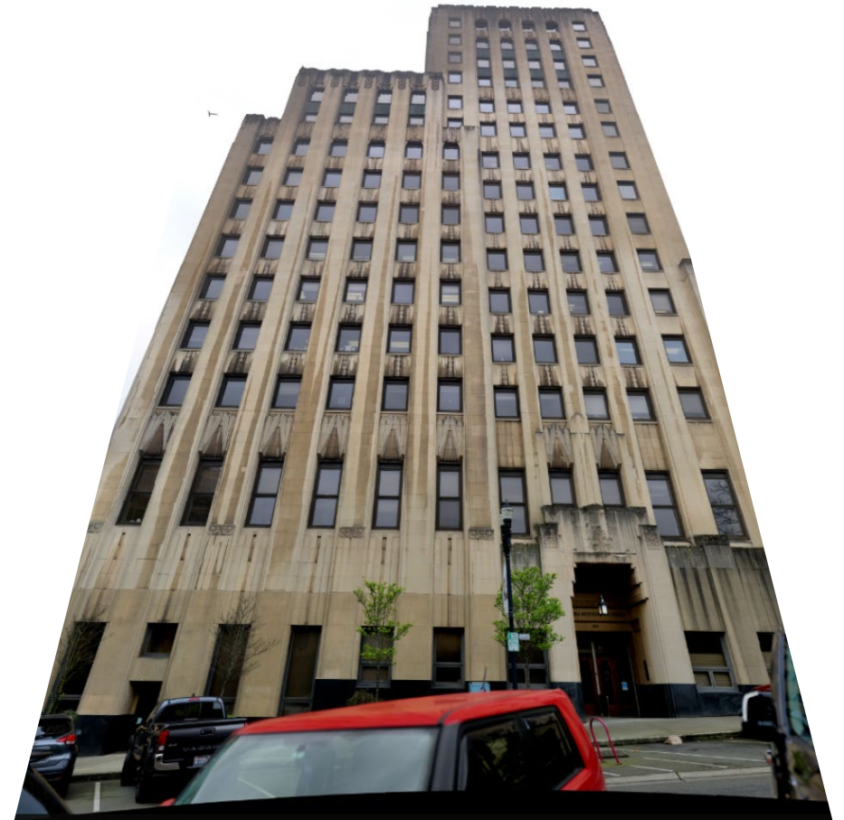
GigaPan photo of east façade (St Helens) Robotic panoramic high-resolution imagery