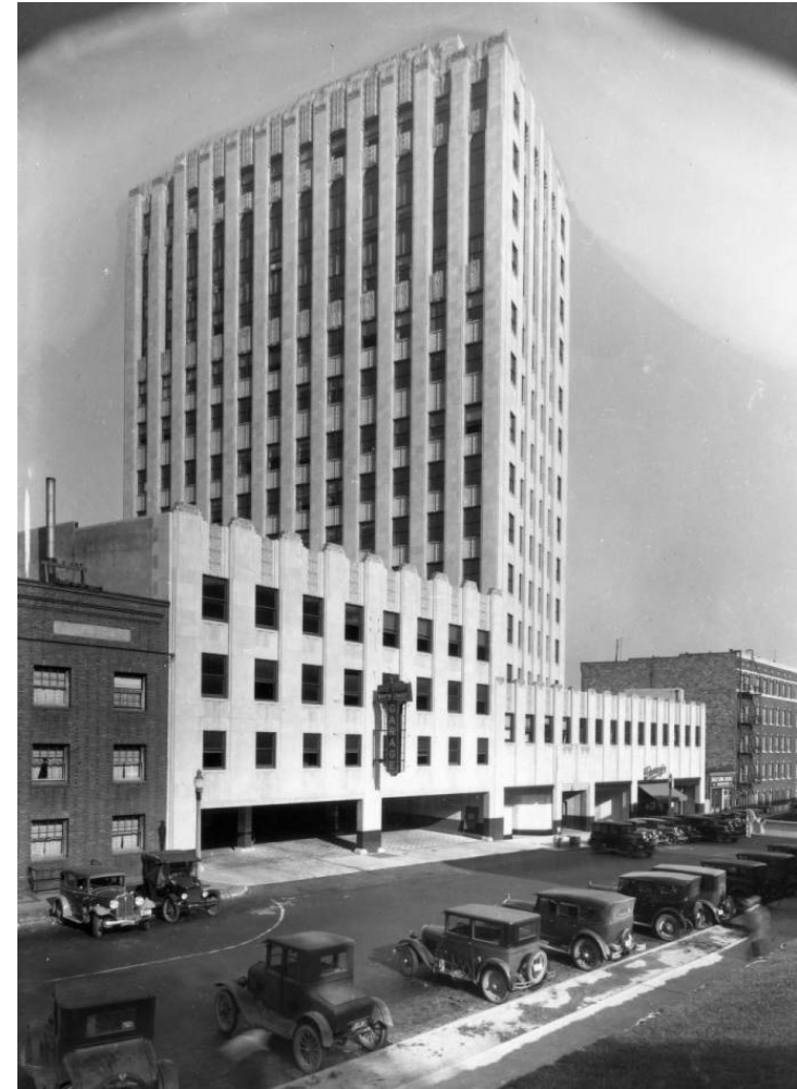
(TPL-6966), 1931