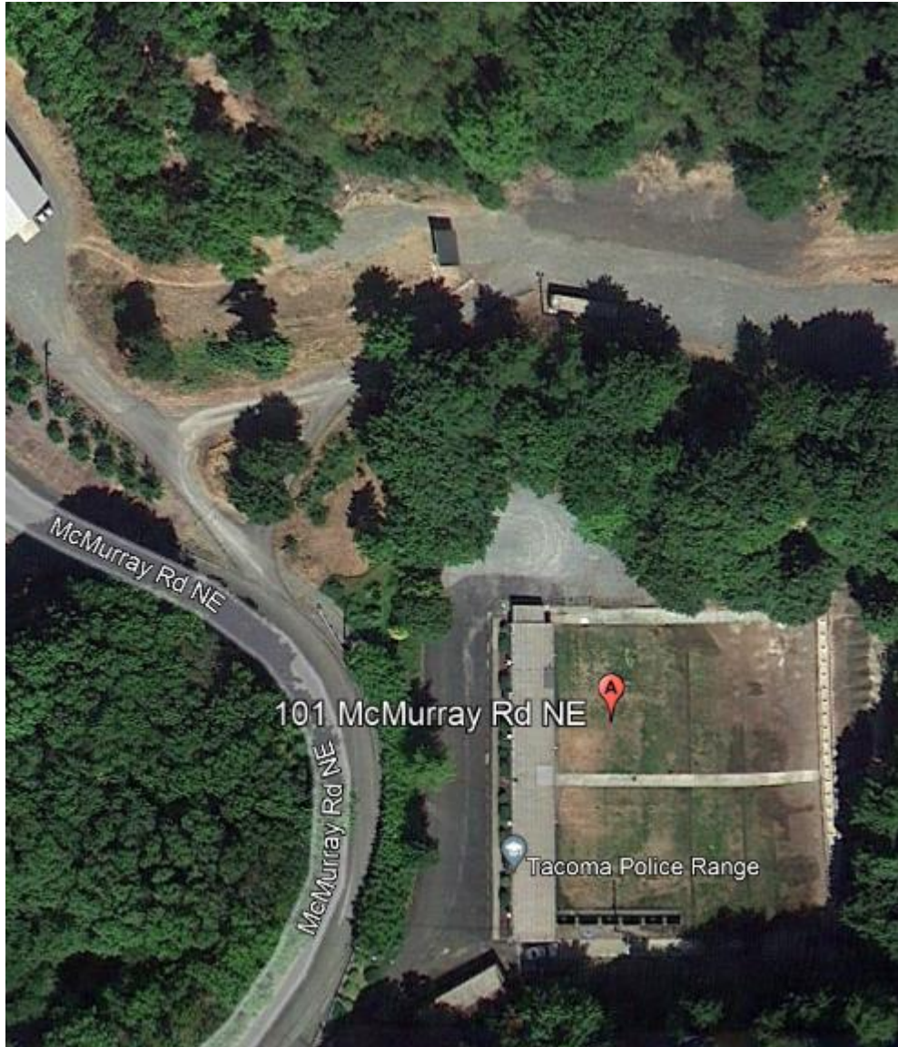
Before drainage improvement work was to start.