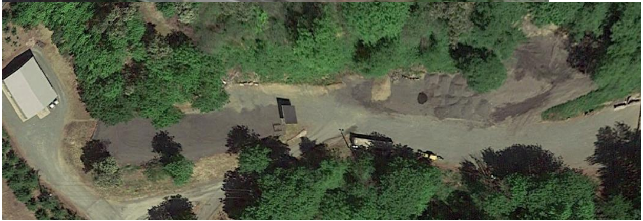
Above failed containment. Second pic show darker soil (Contaminated Soil) Spread in locations of upper range area.